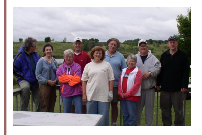
Volunteer were critical to making the Junior Tournament a success

The Lake Lida Junior Tournament was founded eleven years ago by two eleven year old boys who decided that Lake Lida needed a Junior Golf Tournament.