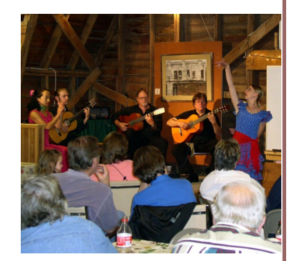
Flamenco guitarist and dancers Performing in The Loft Coffee House

Also new this past year were larger more visible distance markers on the driving range. Also additional fairway was cleared at the longer distances and a second practice tee opened.