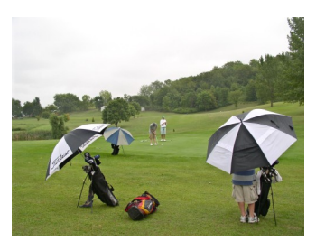
Umbrellas were order of the day at 2006 Lake Lida Junior

n the tournament staff any frequent golfers lembers of Lida Greens.